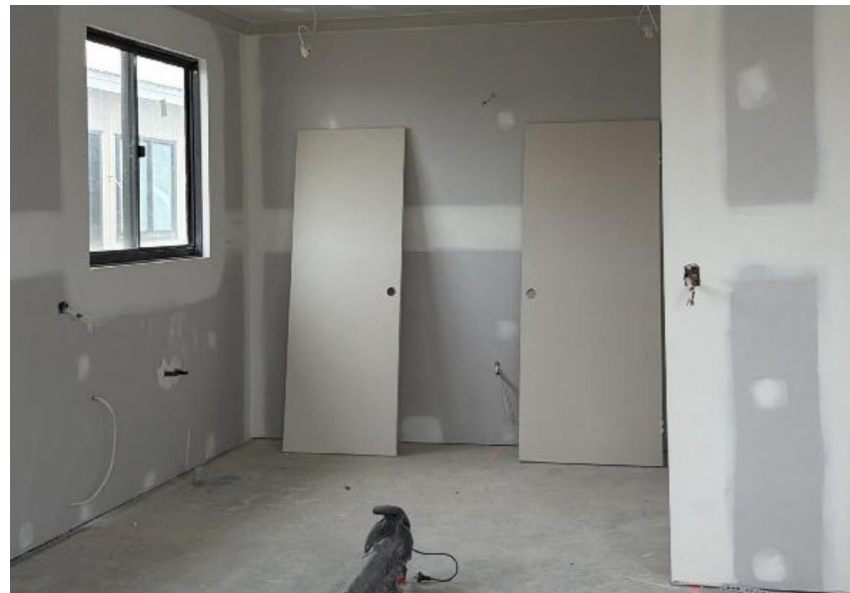
Bedroom area – lining and flushing in progress