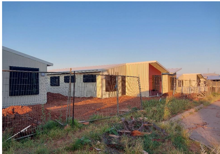
Houses installed and backfilled 2