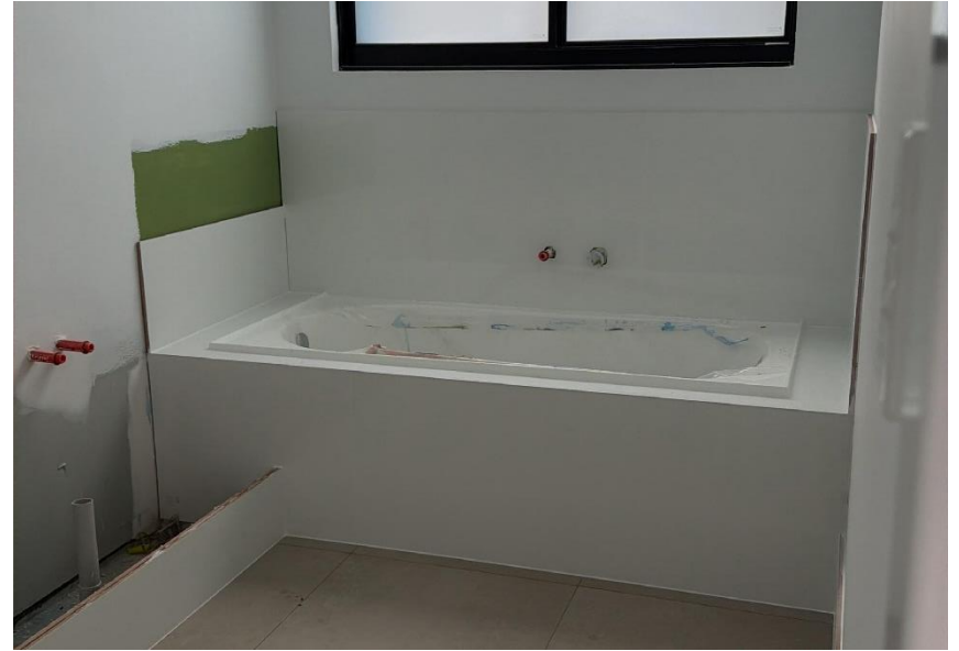
Bathroom and bath - tiling in progress