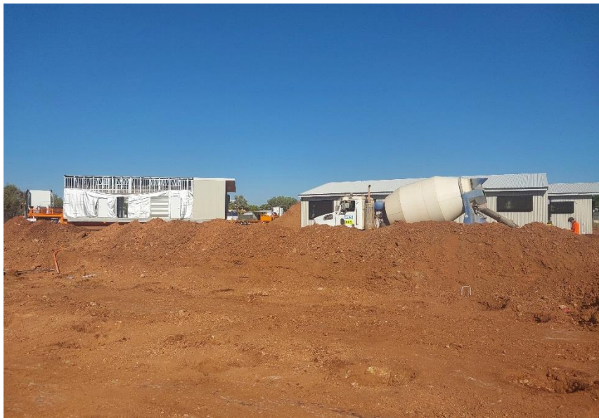
Module being prepared for unloading and installation