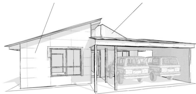
Artistic perspective of townhouse front – Jadura Crescent