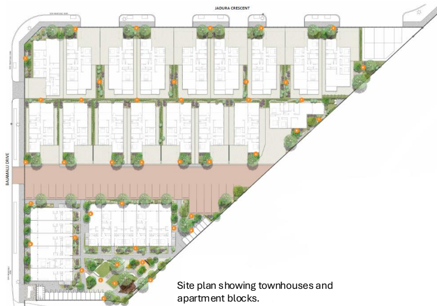
Site plan showing townhouses and apartment blocks.