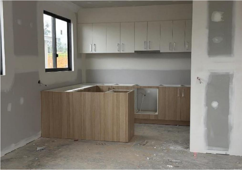
Kitchen area – joinery in progress