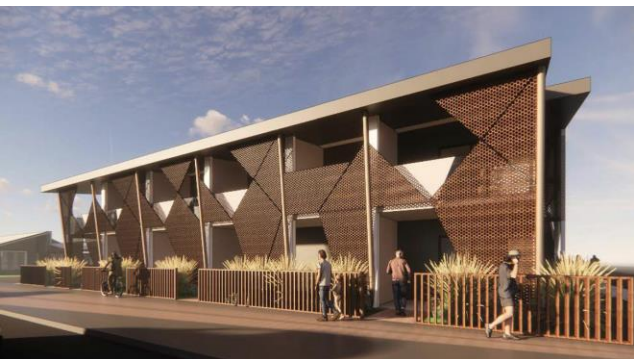
Artistic perspective of apartment block – Bajamalu Drive