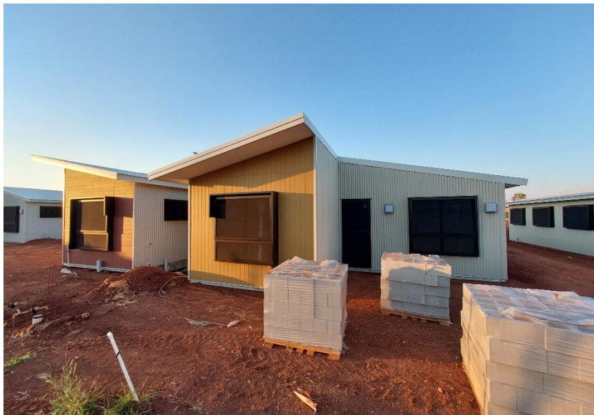
Houses installed and backfilled 1