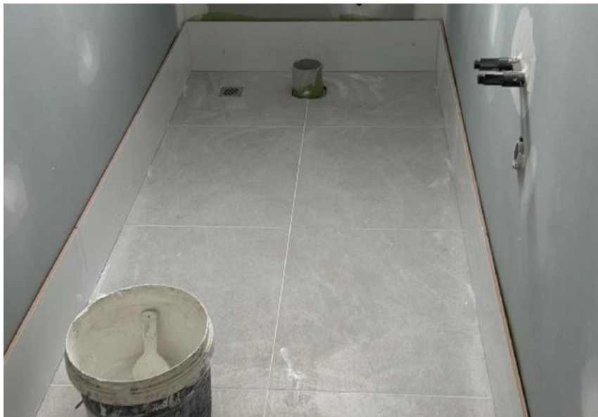
Toilet area – tiling in progress