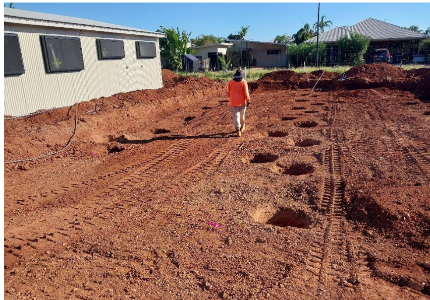
Footing holes dug ready for concrete pour